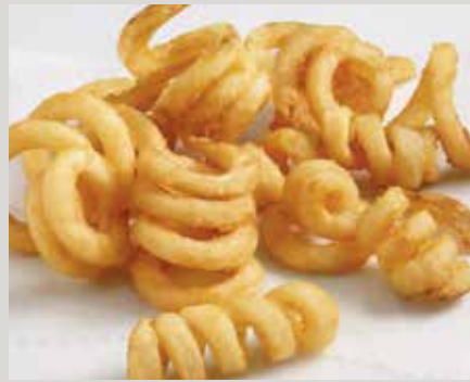
Tater Boy® Crispy QQQ's® (24328)

Also available: LW Private Reserve® (G0033)