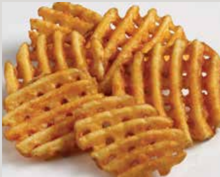
Lamb's Seasoned® Original Recipe CrissCut® Fries (D23)

Also available: Spicy Recipe (34Z) Western Spicy Crispy QQQ's® (24322)