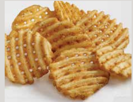
Lamb's Seasoned® Southern Style Recipe Mini CrissCut® Fries (K0120)

Also available: Stealth® Skin-On (S15) LW Private Reserve® (33L) Yukon Selects® (Y1005) Sweet Things® (L0090)