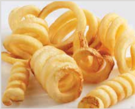
Twister Fries® (C0077) Skin-On

Also available: LW Private Reserve® (G0033)