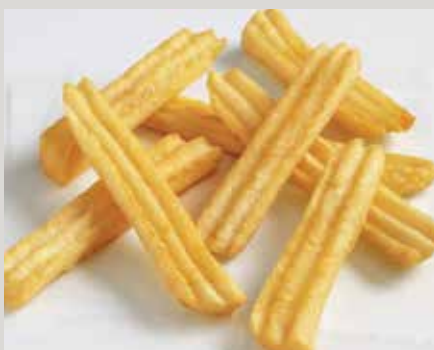
Lamb's Supreme® WaveLength Fries® (D07)

Also available: Lamb's Supreme® Oven Roasted (S0007) Rosemary & Garlic Oven Roasted Red Skin Tri-Cut Dices (AX585)