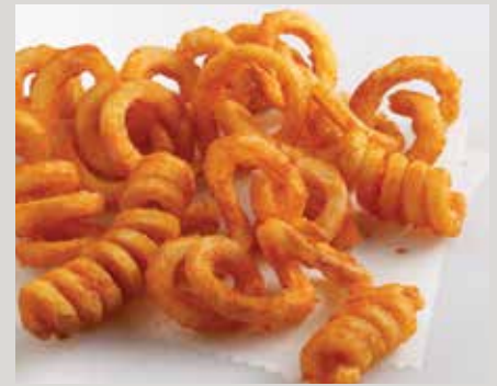
Lamb's Seasoned® Original Recipe Twister Fries® (D0073)

Also available: Curley QQQ's® (Q0004) Stealth® (S0010)