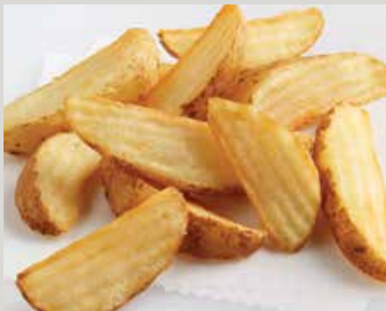
LW Private Reserve® Crinkle Wedge Cut (33D)

Also available: Generation 7 Fries® (X30)