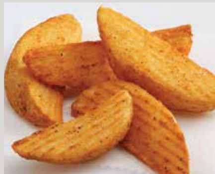
Lamb's Seasoned® Chicken Batter Recipe Crinkle Deli Wedge® (D17)

Also available: Generation 7 Fries® (X30)