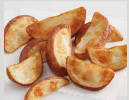
Alexia® Oven Roasted Red Skin Wedge Cut (AX584) Non-Seasoned (AX586)

Also available: Slim (D19) Bites (D20) Generation 7 Fries® Slim (X24)