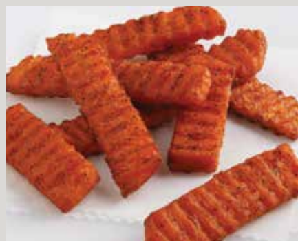
Sweet Things® Seasoned RibCut® Fries (L0097)

Also available: Sweet Things® Savory WaveLength Fries® (L0082)