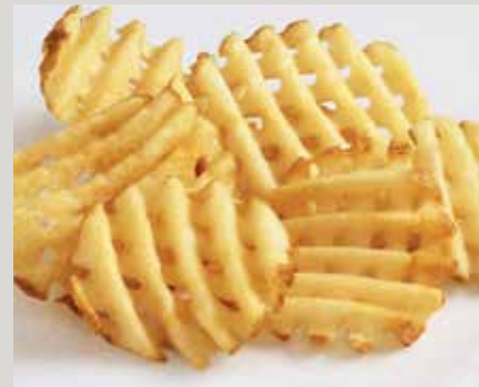
CrissCut® Fries (P55) Skin-On

Also available: Spicy Recipe (Y0066) aMAIZEing Fries® (P26)