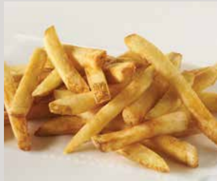
House Cuts® 3/8 Regular Cut (25029) Just potatoes, oil and sea salt