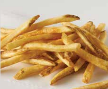
House Cuts® 1/4 Shoestrings (25030) Just potatoes, oil and sea salt

of operators agree that simple labels will influence purchase decisions in the future 5