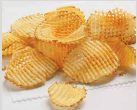
House Cuts® Lattice Chips (H3031)

Crunchiness along with flavour is one of the most important attributes in potato chip satisfaction 1