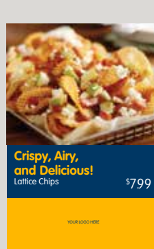
2-Sided Table Tent/Insert